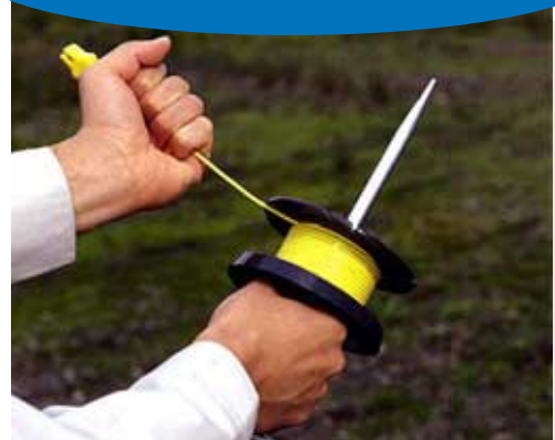
9216 CABLE WINDER (supplied)